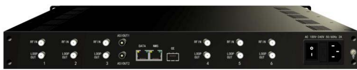
Tuner Input Version