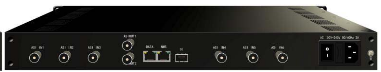
ASI Input Version